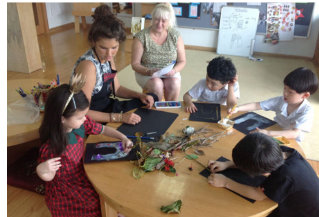
Supportive Teaching and Learning Observations

teachers and staff work in constructive partnership with parents. Eton House Hanoi is always looking for recommendations of best practice, through latest research in early childhood education as well as working on a continuous cycle of self-improvement.