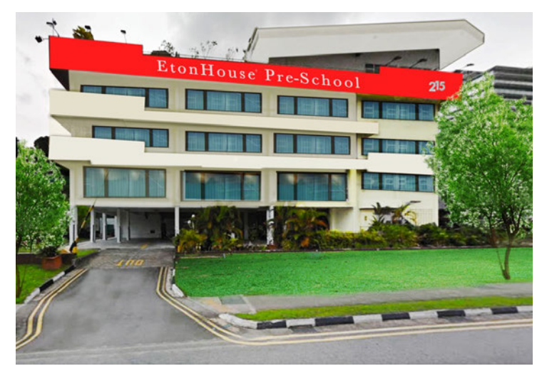
215 Upper Bukit Timah Road - Artist Impression

offering children countless opportunities to engage and learn across multiple disciplines. The schools will offer the renowned EtonHouse Inquire Think Learn pedagogy delivered by highly qualified international and local educators. Children will be immersed in an integrated bilingual environment and will be exposed to both English and Mandarin at all times, allowing them to pick up both languages spontaneously and effectively in a natural environment.