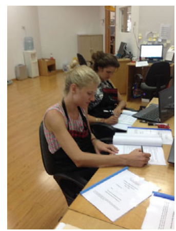
Student progress tracking

appraisals and professional development plans. EtonHouse Hanoi also aims to keep a high level of happiness and satisfaction through its' Student, Parent and Staff Satisfaction Surveys etc. which are given out on a regular basis through a warm and professional 'Open Door' policy. Here,