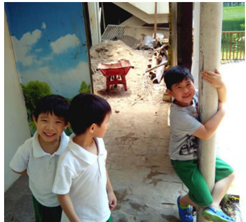
Renovations behind the scenes

These are busy times at EtonHouse Jakarta. The school is undergoing major renovations to accommodate more students in an enhanced learning environment. The teachers have also had their bi-annual professional development sessions.